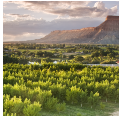
GRAND JUNCTION WINERY