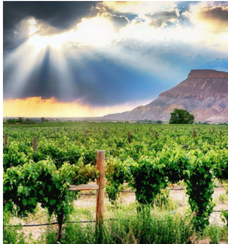
GRAND JUNCTION WINERY