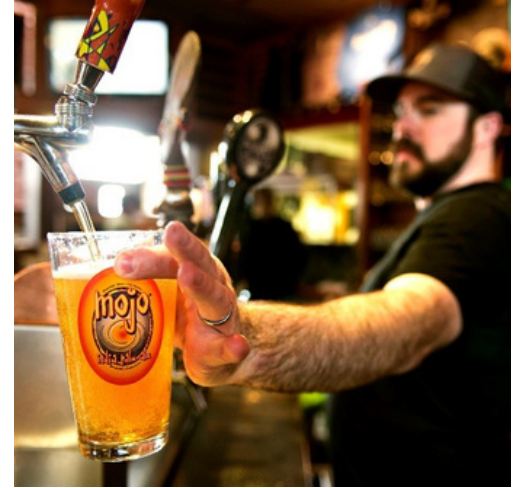
BOULDER BEER COMPANY, BOULDER