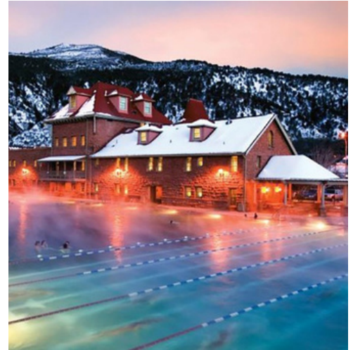
GLENWOOD HOT SPRINGS POOL