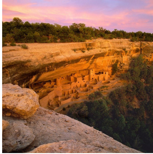
MESA VERDE NATIONAL PARK