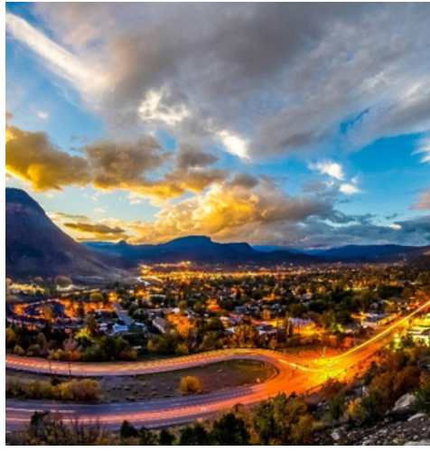
DURANGO AT DUSK