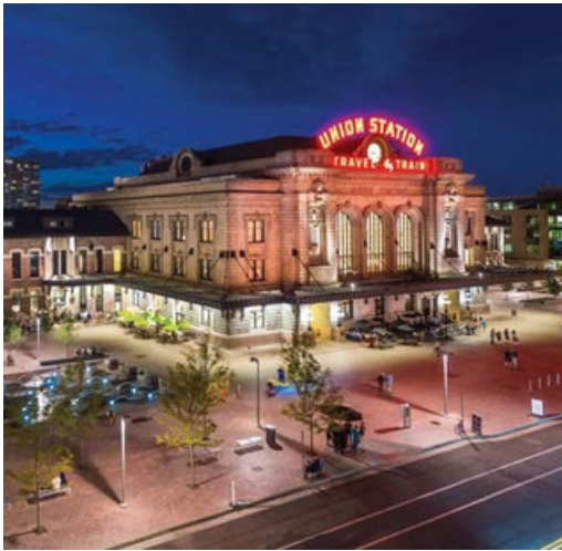
DENVER UNION STATION