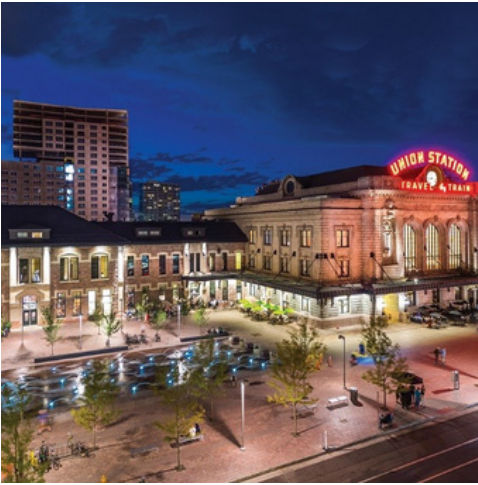
DENVER UNION STATION