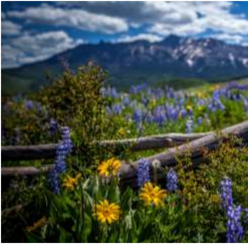
LAST DOLLAR ROAD