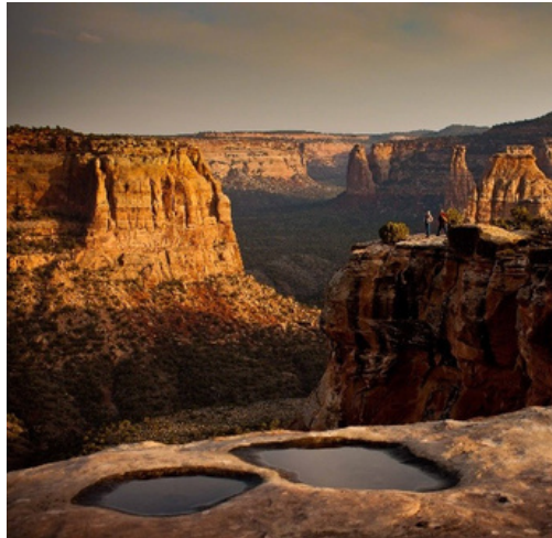
COLORADO NATIONAL MONUMENT, GRAND JUNCTION