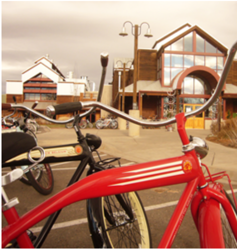
NEW BELGIUM BREWERY, FORT COLLINS