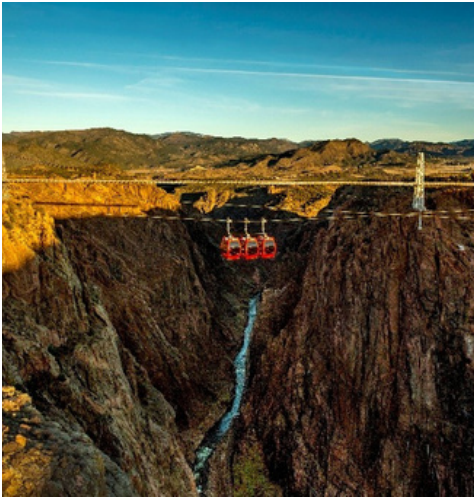
ROYAL GORGE BRIDGE, CANON CITY