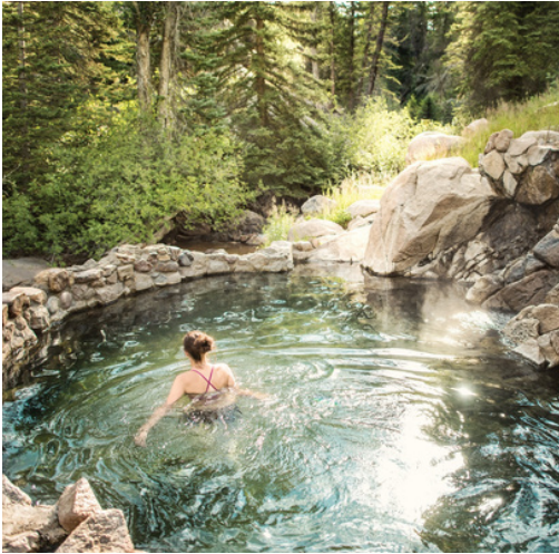
STRAWBERRY HOT SPRINGS