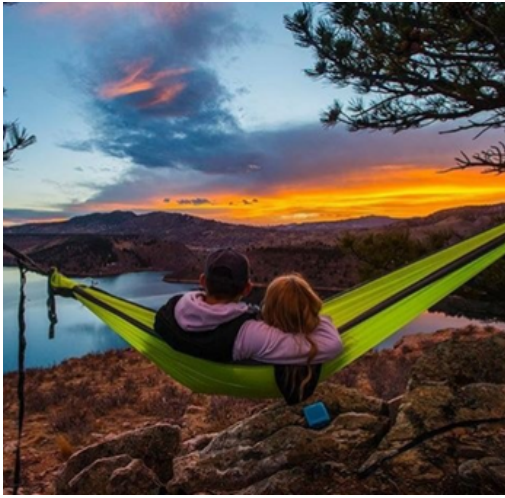
HORSETOOTH RESERVOIR, FORT COLLINS