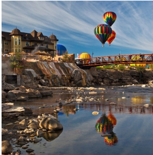
PAGOSA SPRINGS HOT SPRINGS