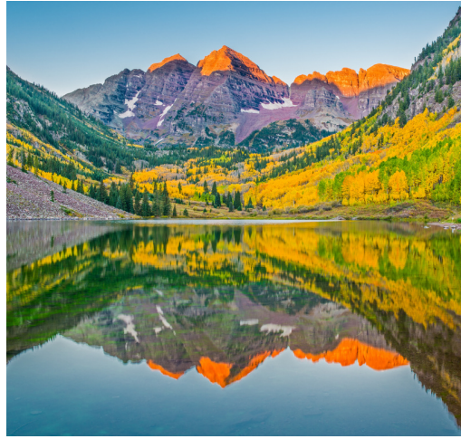
AUTUMN IN ASPEN