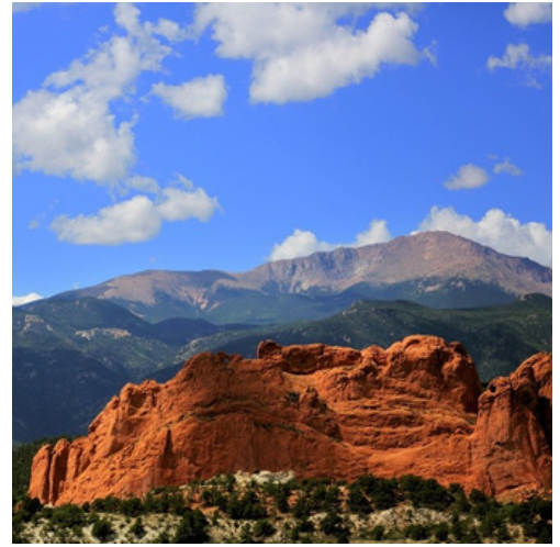
GARDEN OF THE GODS, COLORADO SPRINGS