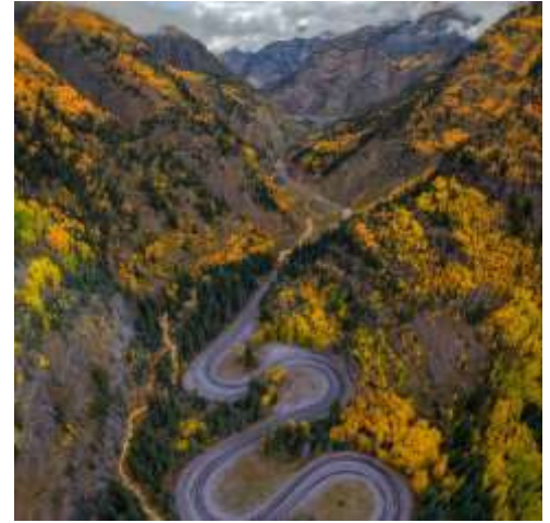
MILLION DOLLAR HIGHWAY