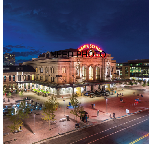
DENVER UNION STATION