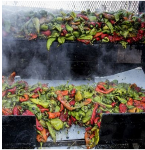
CHILI FESTIVAL, PUEBLO