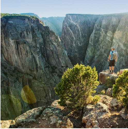
BLACK CANYON NATIONAL PARK