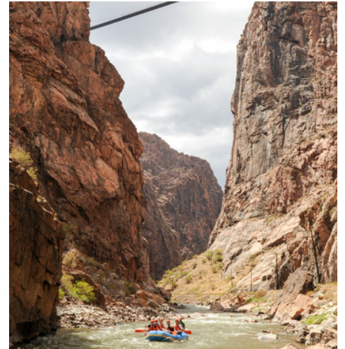
ROYAL GORGE, CANON CITY