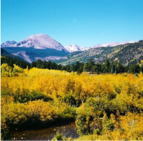
PEAK TO PEAK HIGHWAY, NEAR ESTES PARK