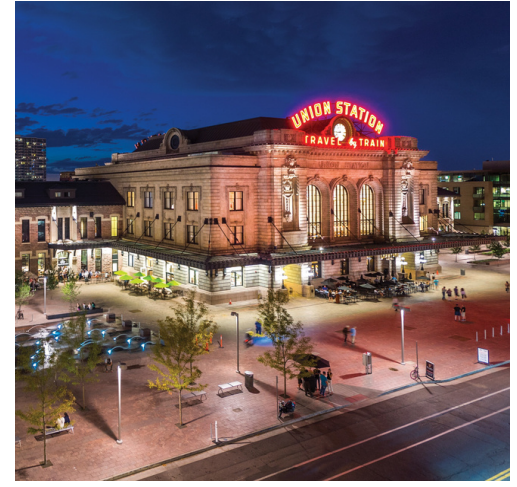
DENVER UNION STATION