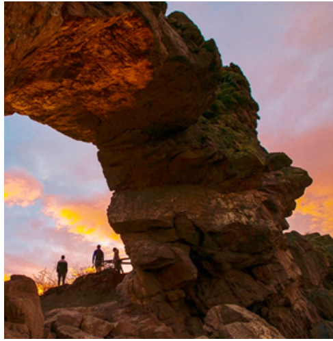
DEVIL'S BACKBONE, LOVELAND