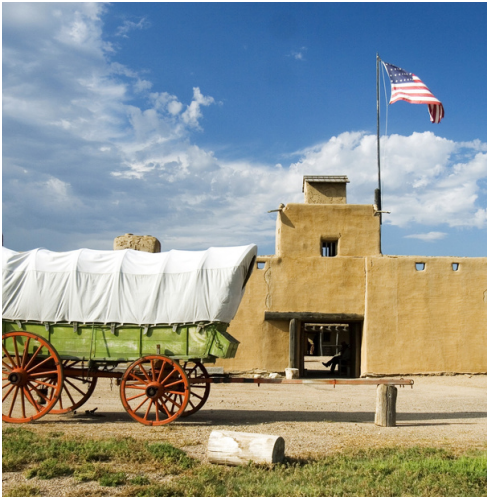
BENT'S OLD FORT, LA JUNTA