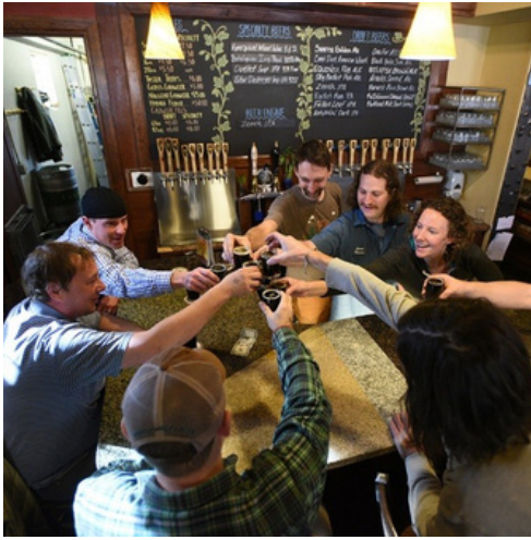
BREWERY IN FORT COLLINS