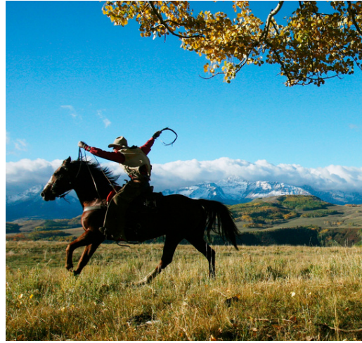
COLORADO DUDE RANCH